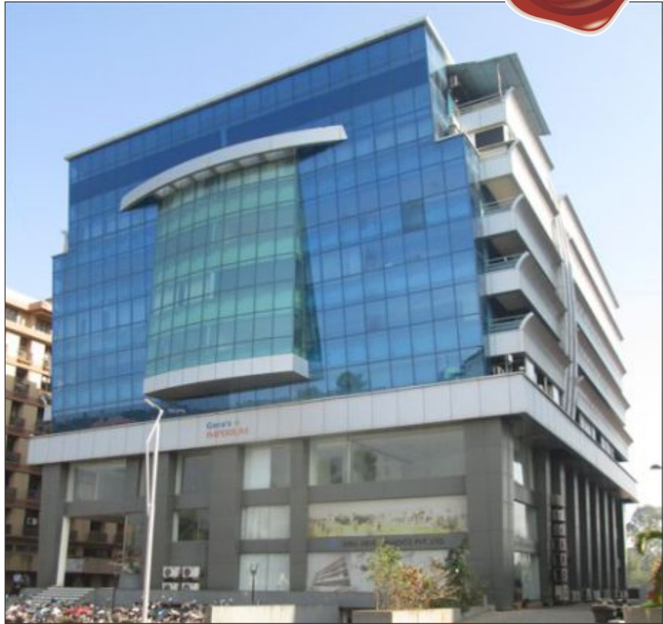
Actual Photograph – Gera's Imperium