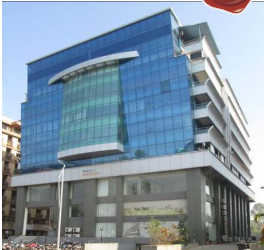
Actual Photograph – Gera's Imperium