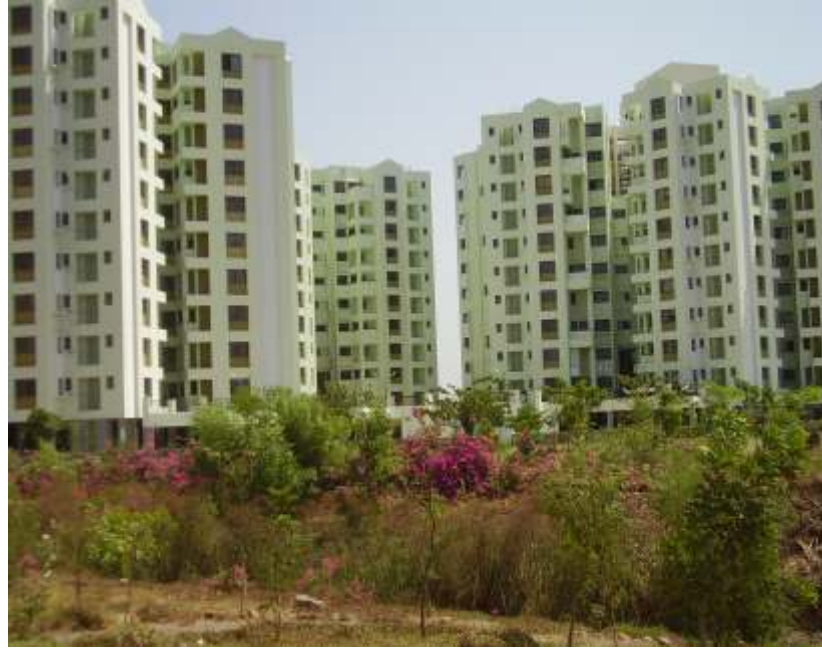
Actual Photograph – Gera's Emerald City North