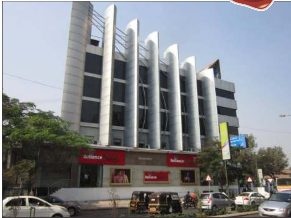
Actual Photograph – P. T. Gera Centre