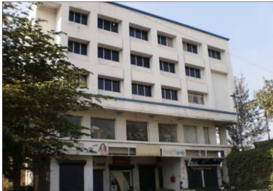
Actual Photograph – Shakti Chambers