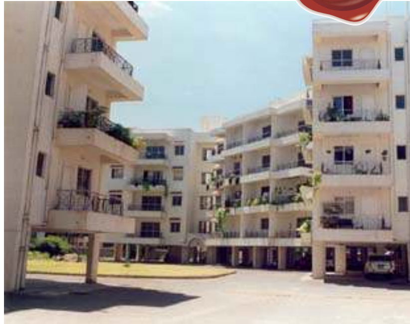
Actual Photograph – Atur Park