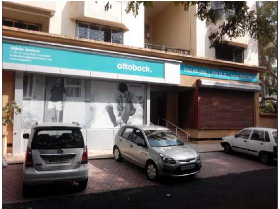
Actual Photograph – Gera Grand